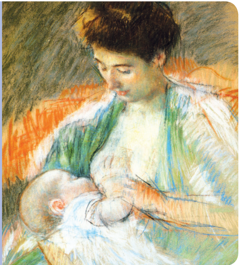
Detail of "Mother Rose Nursing Her Child" by Mary Cassatt.